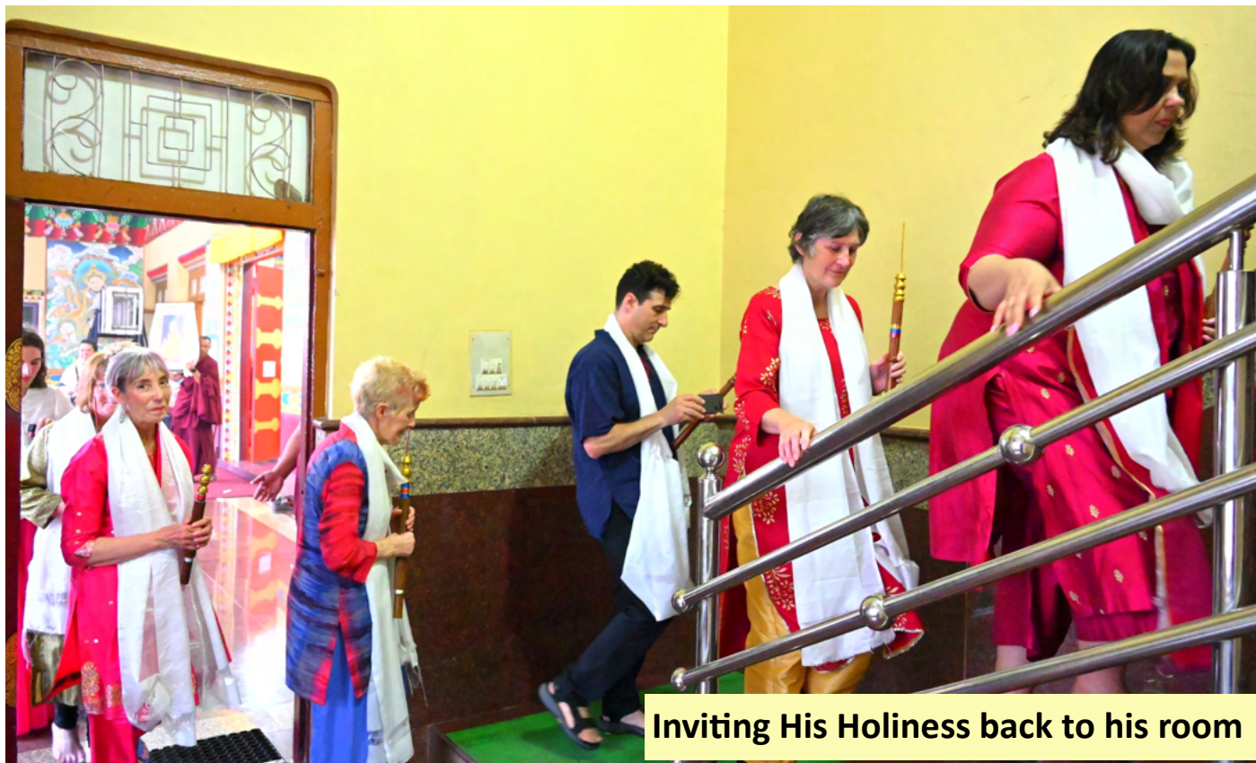
Inviting His Holiness back to his room