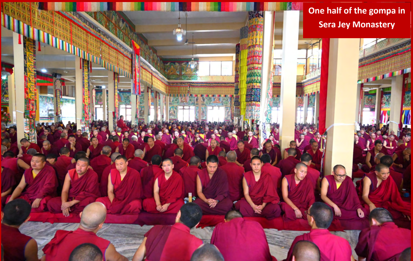
One half of the gomba in Sera Jey Monastery