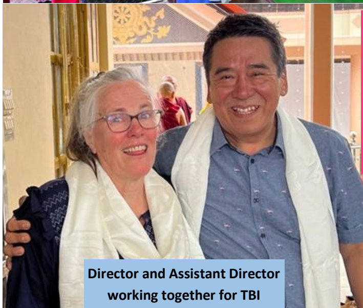
Director and Assistant Director working together for TBI